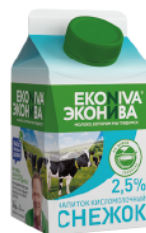
SNEZHOK FERMENTED DRINK 2.5% fat TU 10.51.52-002-20048084-2019 Net weight: 500 g Package: Pure-Pak Shelf life: 21 days Bar code: 4680017923606 Group package: 10 pcs