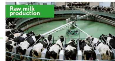
Raw milk production

Dairy products are manufactured at 4 processing plants.