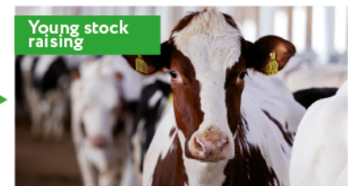
Young stock raising

Formulation of a perfectly balanced ration tailored to each cow's needs.