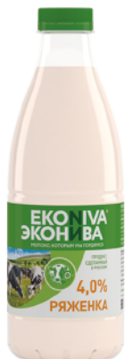
RYAZHENKA 4% fat GOST 31455-2012 Net weight: 1,000 g Package: PET bottle Shelf life: 21 days Bar code: 4680017923163 Group package: 6 pcs