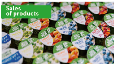
Sales of products

Advanced methods of young stock feeding and housing.